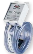
Slack Tube® Manometer rolled up for easy handling and storage