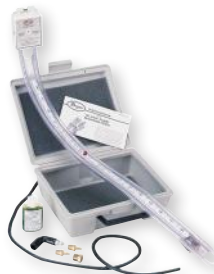
1212 Gas Pressure Kit